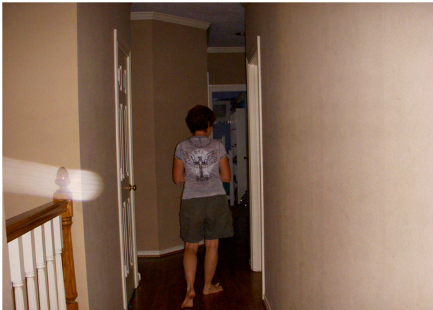
Image 1: Below is a bright "orb" caught on camera by my daughter, Michelle, who decided to take pictures when she felt her brother's presence a few days after Erik's passing. The "comet's tail" implies movement, so we had it analyzed by photography expert, Rahasya Poe. In the

second photo (image 2), the gamma is reduced, revealing that the orb is its own light source, which casts light on nearby structures.